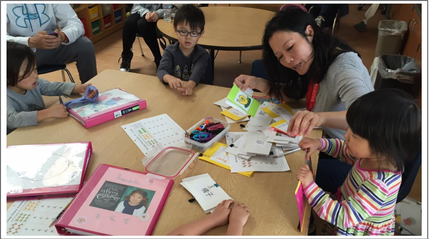
♥ How cute! Our preschoolers performed at the Chinese New Year Festival in 2016.