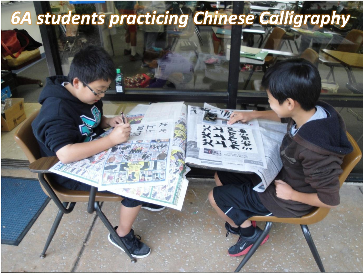
6A students practicing Chinese Calligraphy