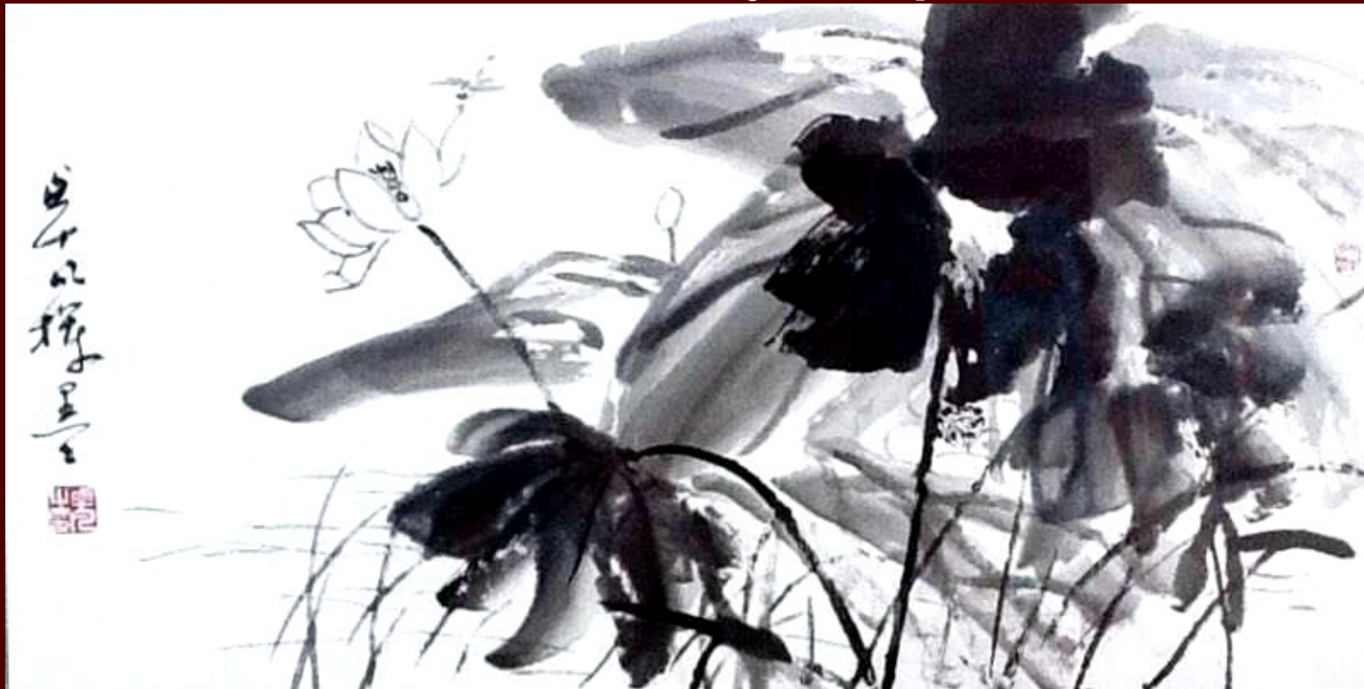
Painting by Check Ng 伍卓凡